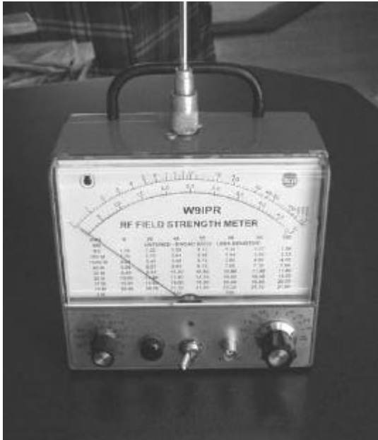
The HF Field Strength Meter is shown here with the antenna connected at the PL259 connector on top of the case. A 2-turn “sniffer” coil on a 3’ piece of co-ax can be connected at the front panel BNC connector.

(BB) position that eliminates the tuned circuit so the instrument is not frequency sensitive.