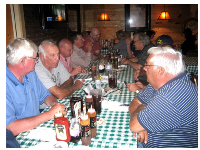
The group waited impatiently for the really great dinner at the Barbeque Shack Friday evening.

Again, it was a great time and we probably sold over about 500 lbs. of stuff amounting to about $2000 on behalf of the Scholarship Fund. Plus, it was a lot of fun.