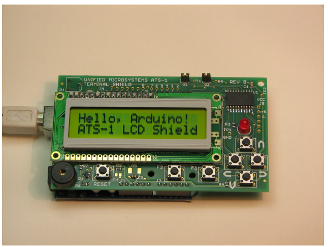
Arduino LCD terminal shield developed by Gary Sutcliffe (ATS1W9XT)

What about ham radio projects? I really have not searched for Arduino ham radio projects but have come across them used for repeater controllers, CW keyers, rotor controls, satellite tracking, APRS, and systems for controlling multiple radios in a contest. That is probably just scratching the surface.