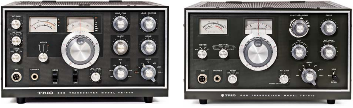
Trio TS-500 HF Transceiver (Pre-1970) Trio Photo