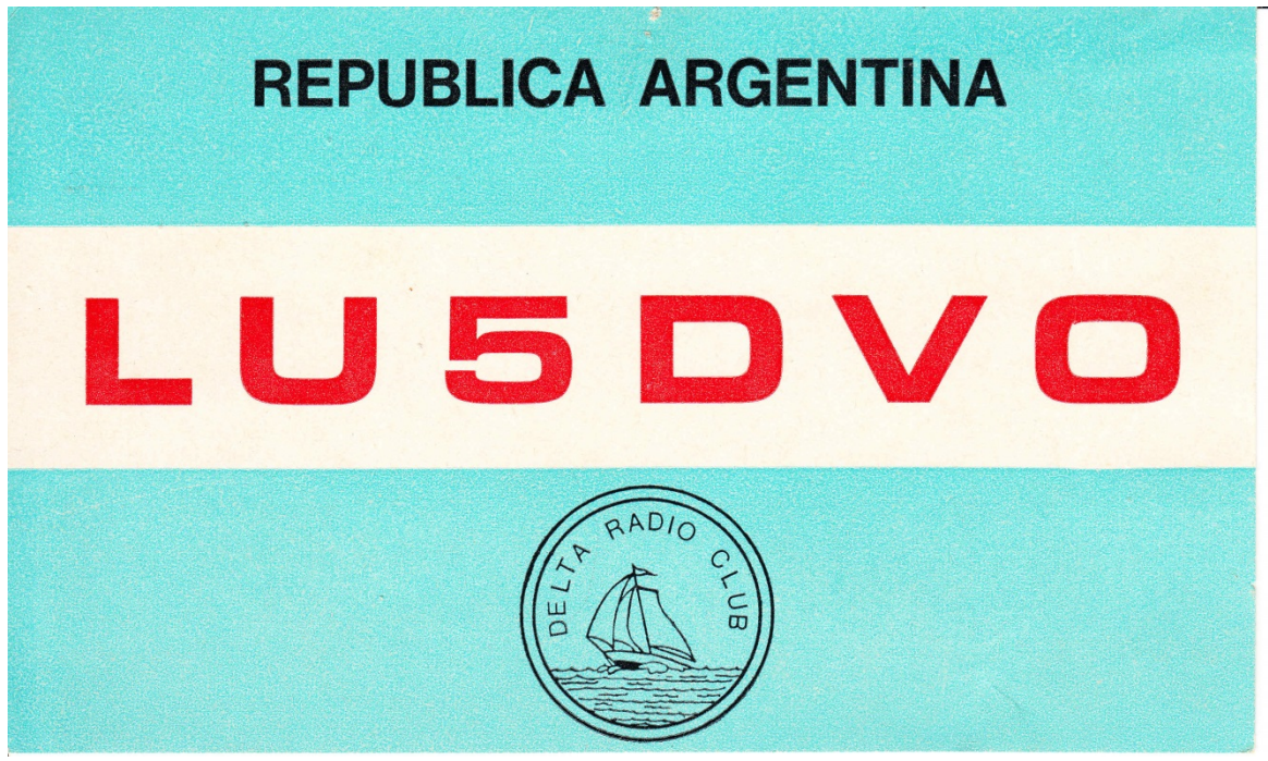
My very first DX QSL. I was a Novice and the contact was made with a 75 watt crystal controlled transmitter and a 40M dipole on CW.

October is generally considered to be the best month of the year for HF propagation. It is also the last month for decent weather for getting antenna work done. Take advantage of it!