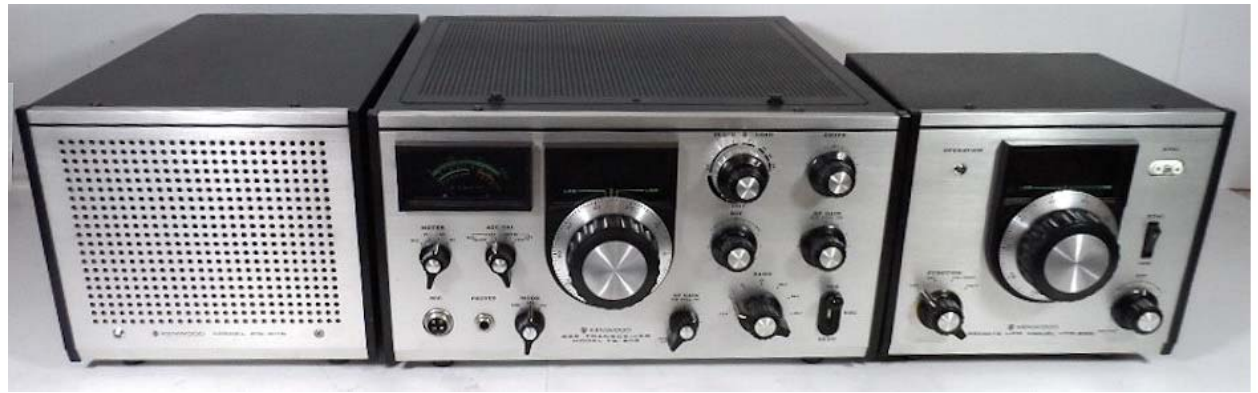
Left to Right PS-511S Power Supply, TS-511S Transceiver, VFO-5SS Remote VFO

offered were major accessories, including the PS-511S AC Power Supply/Speaker as well as the VFO-5SS Remote VFO. The TS-511S was the first of Kenwood's popular priced "500 series" transceivers (in the North American market) that exist with us today with the current TS-590SG model.