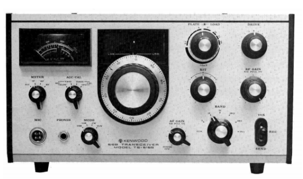
Kenwood TS-515S HF Transceiver

Photo color differences are not present in actual units – they are identical except for the actual model number at the bottom center of the front panels. Well, maybe better called, "almost identical." My own early TS-511S does not have a TUNE position on the MODE switch – the TS-515S, and the later builds of the TS-511S have that fourth MODE position. It is hard to see, above, but the MODE switch is to the lower left of the Main Tuning Knob on both radios – note three positions on the TS-511S and four on the TS-515S.<sup>13</sup>