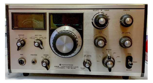
Kenwood TS-511S HF Transceiver

Kenwood did not offer the TS-511S or TS-511D outside the United States. However, they did offer the identical TS-515S and apparently a TS-515D<sup>10</sup>. Here are the TS-511S and the TS-515S, side by side . . .