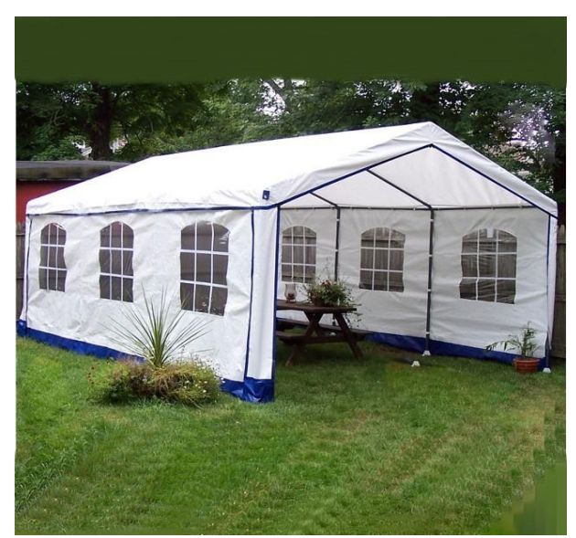
Tent the ORC is considering purchasing to replace its current dilapidated Field Day tent.