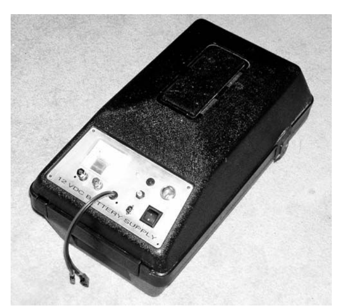
The exterior of the 12 VDC Battery Supply shows the voltmeter, circuit breaker, switch and power termination's

It all started at the Town recycling center. How could a person allow a beautiful battery box with sump pump control circuitry and a charger (I thought) to be thrown into the dumpster. They can't. Therefor I rescued the container from oblivion with the promise of a new more rewarding life as a portable re-chargeable 12 VDC power source.