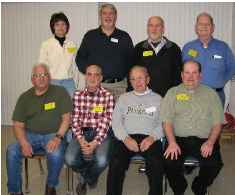
2012 ORC Officers