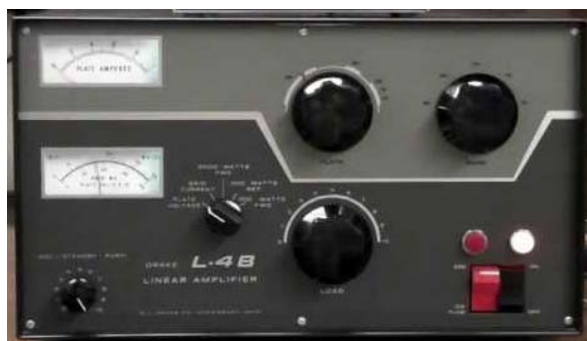
L-4B Linear Amplifier (2x 3-500z Eimac Tubes)