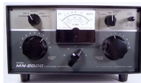
MN-2000 Antenna Matching Network