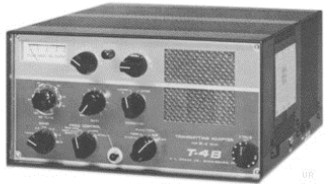
Drake T-4B Reciter (Matched the R-4B Receiver)

“Reciter” would seem to imply – reciting what the receiver told it to say. That is, what frequency to be tuned in on the band.