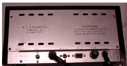
AC-4 AC Power Supply (Mounted in MS-4)

Drake “4-Line” Accessories were used with the Drake Receivers, Transmitters. and the TR-3 and TR-4 series Transceivers . . . (Small note – the TR-3 was unique in its “3” number. It fits in more precisely as an “early TR-4” than a unique radio model.)