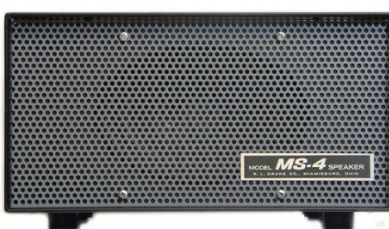
MS-4 Speaker Console