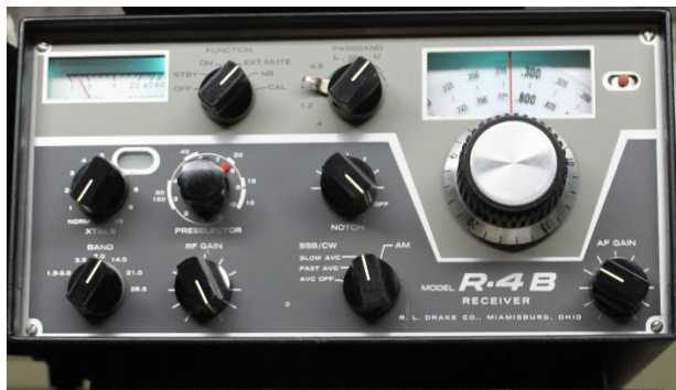
Drake R-4B Receiver

In 1964, Drake entered the transceive capable separate receiver and transmitter market after the TR-3 and TR-4 Transceivers (reference two past articles on those fine radios). Drake introduced what became one of the most popular sets of separate radios of all time – the Drake R-4 Receiver and T-4X Transmitter – better known as the “Drake Twins” or the “Drake Separates.” They extended with very similar design through the R-4, R-4A, and R-4B Receivers and the T-4X and T-4XB Transmitters. (There was no T-4XA Transmitter.) While similar in appearance, the R-4C Receiver and to some degree the T-4XC Transmitter were new designs and will be the subject of a future article. Below is a beautiful R-4B and T-4XB station owned and operated by my long-time friend, Roger, K9VSK, of Roanoke, in central Illinois: