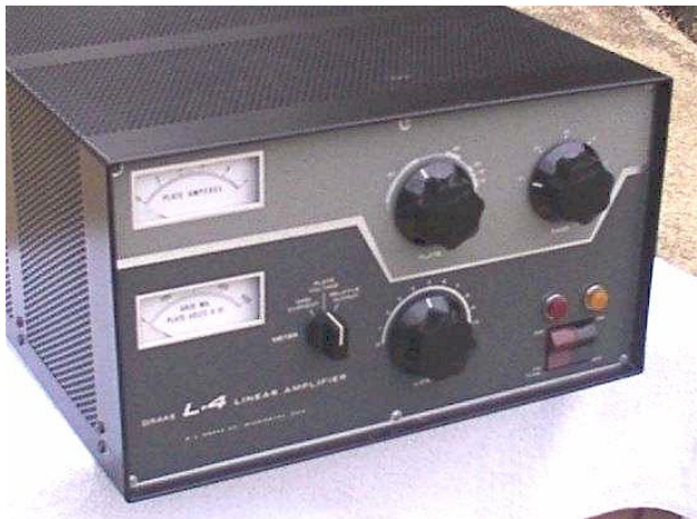
L-4 Linear Amplifier (Predates the L-4B) (2x 3-400z Eimac Tubes)

Other accessories were also used with the very popular Drake “4-Line” Receivers, Transmitters and Transceivers: