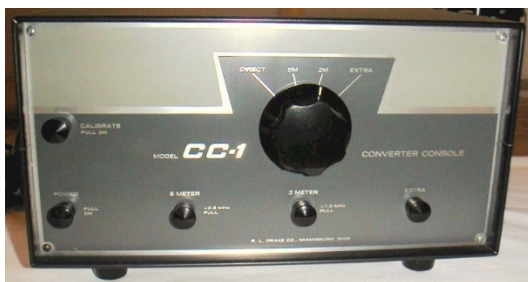
Drake CC-1 Converter Console (Holds Receiving Converters)

Drake also had a rather unique group of accessories to allow the “4-Line” equipment to access six and two meters using separate receiving and transmitting converters. Here for reference they are shown: