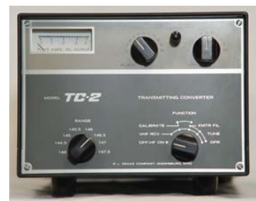
Drake TC-2 (Transmitting Converter)

(Drake manufactured converters for 6 and 2 meters – but had provisions for others.)