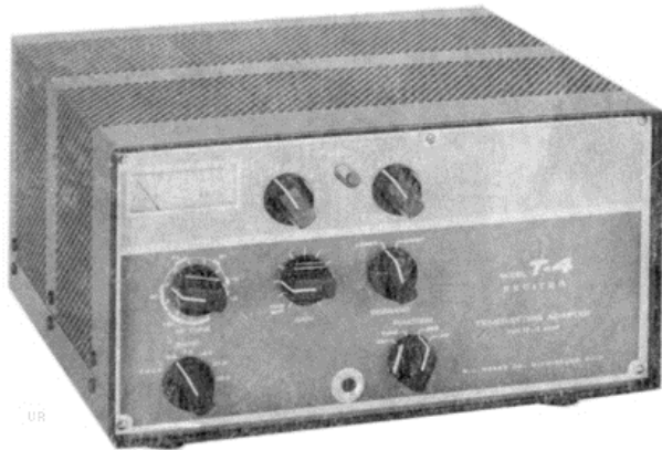
Drake T-4 Reciter Matched the R-4 and R-4A Receiver

To counter the need for a lower cost transceiver alternative for commercial customers, Drake had two transmitter models over time: