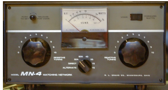
MN-4 Antenna Matching Network

(Pictures from other collectors preferring anonymity.)