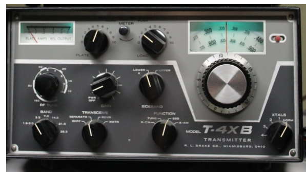
Drake T-4XB Transmitter