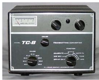
Drake TC-6 (Transmitting Converter)