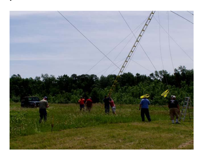
Up she goes. Saturday morning involved raising the 5 towers used by the ORC again this year.