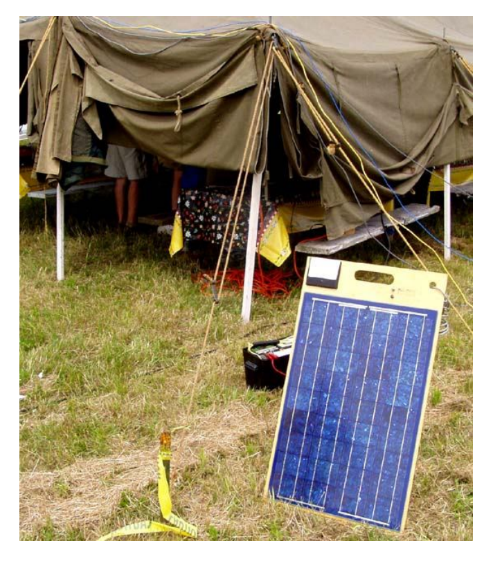
Ed Rate (AA9W) again brought his solar powered HF station for use at the GOTA site in the cook tent.