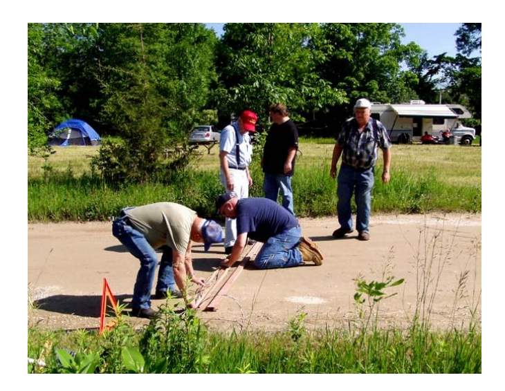
Getting power to the other side of the road is no simple task. The power and computer cables have to be protected within the portable steel cable housing that that was made for the ORC field day by Mark Potash.