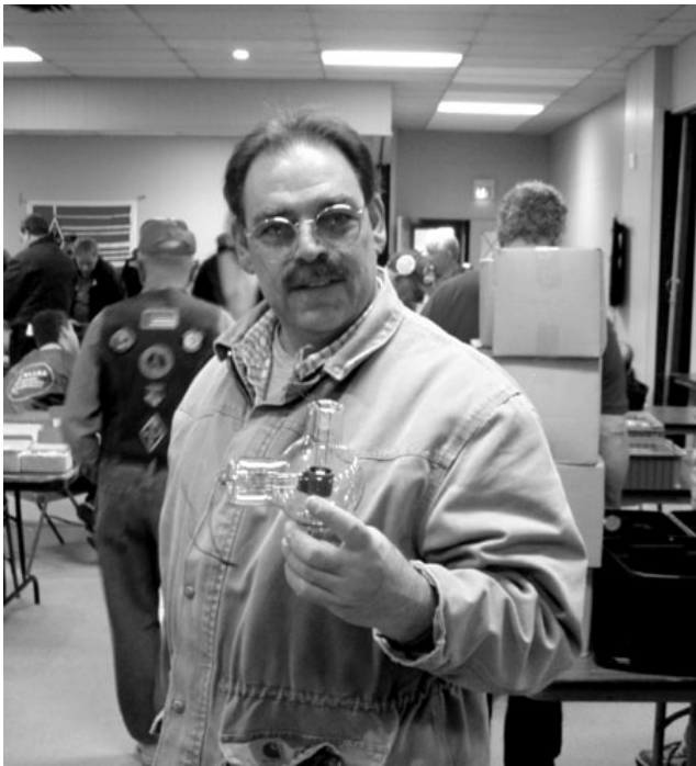
For the collector, a bonanza.