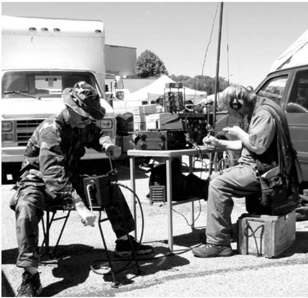
These guys were really cranking and acting as net control for a military equipment net.