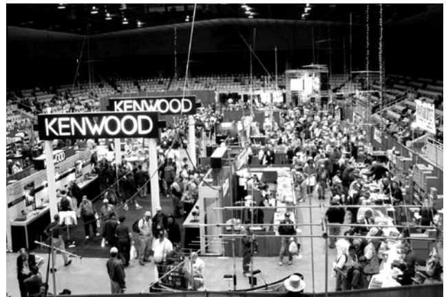
Although most of our time seemed to be spent in the outside flea market the big names and seminars were inside providing a glimpse into the future of HAM Radio