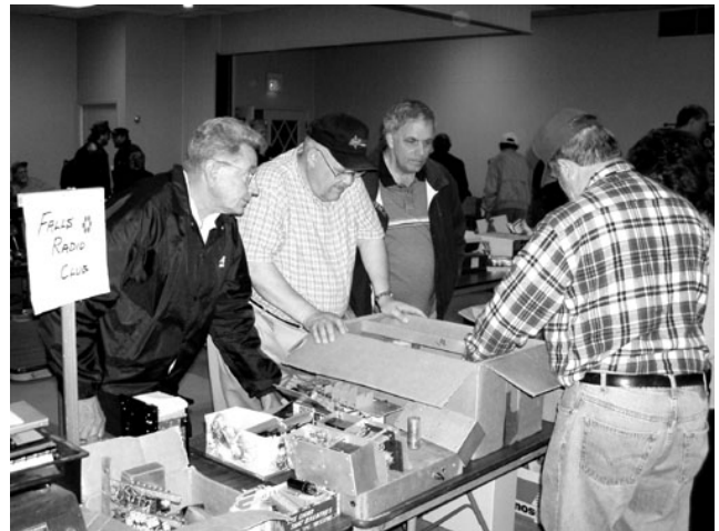
The Menomonee Falls Club table had almost everything you could think of and promoted some real treasure hunts.