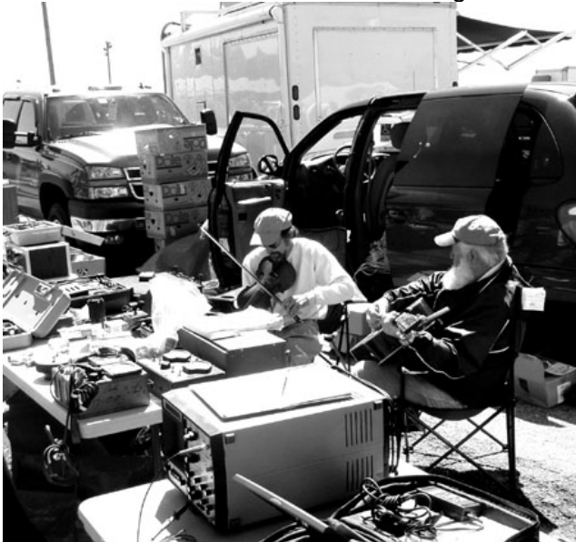
The Blue Grass Gang again drew a good crowd to listen while pretending to be interested in their wares.