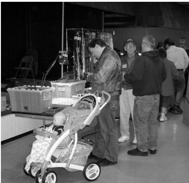
Baby setting is no reason to miss a good swapfest – start them out young.