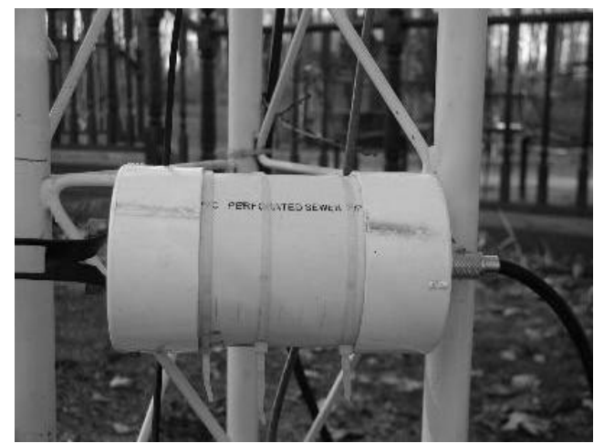
A ten-turn balun wound inside a length of PVC drainpipe.

Below is shown a ten-turn co-ax balun wound inside a 4" diameter PVC pipe and feeding the 450ohm ladder line to the G5RV at the shack of W9IPR.