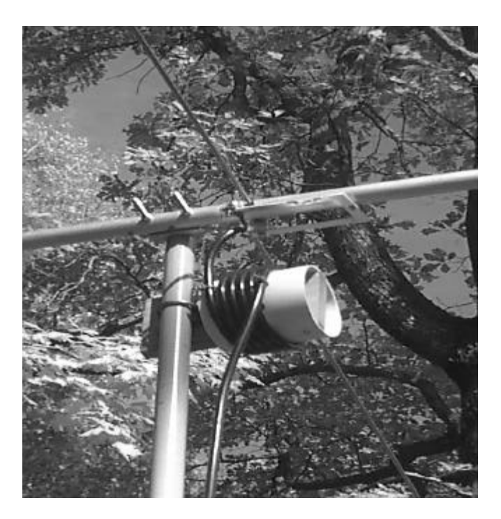
Balun of Coax Feeding a 6 Meter Beam Driven Element

This type of co-ax balun can also be used as a remote balun. That is, it can allow co-ax to be routed through the shack to the outside where the co-ax balun can be inserted in the line to convert to a balanced feedline as used with a multi-band center fed Zepp.