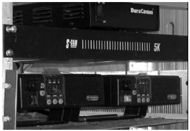
The ORC Link Repeater Receiver (right), Transmitter (left), Controller (middle) and power supply (top)

Stronger signals will generally get through, but weaker, more distant, signals will need to overcome the blocking the transmitter does on the receiver.