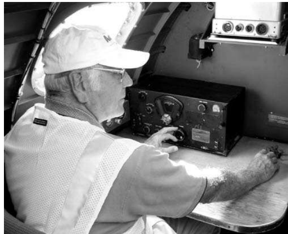
At least the radio operator had a view as he listened to code on his BC348. These receivers are still available occasionally at swap-fests.

Also there were a number of WWII B-17 veterans who were only too eager to share their stories about flying out of the airfields about London and into the German airspace – their stories are hair rising and we certainly owe them a great debt of gratitude.