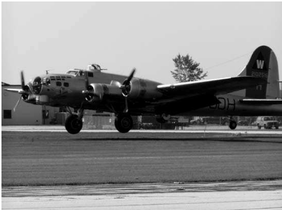
Touchdown of the B17 is truly a beautiful sight and sound. It was a rare opportunity

On Sept. 26-29 the EAA B-17 "Aluminum Overcast" was at the West Bend airport as hosted by EAA chapter 1158.