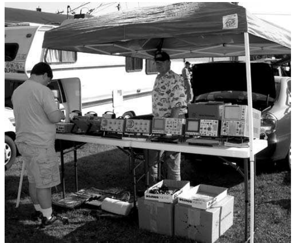
Here was a beautiful display of quality test equipment for sale. Amazing what will fit in the trunk of the car.