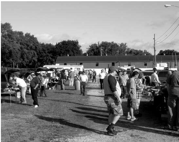
There was a great variety of vendors this year and we filled two complete rows on both sides of the isles.