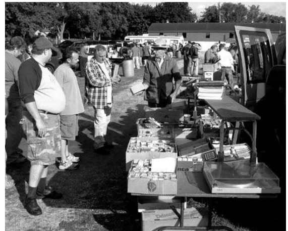
Lots of vacuum tubes, manuals and whatever. Something for everybody.