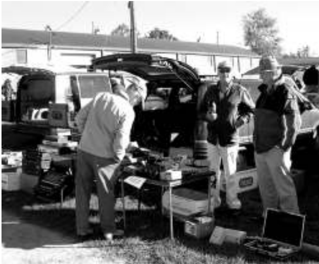
The West Allis club was here with a variety of audio and RF equipment for sale.

It was generally a success and a lot of fun. The weather was good even if a bit cold initially and the facilities were excellent. Coffee, bathrooms, the barn and plenty of space.