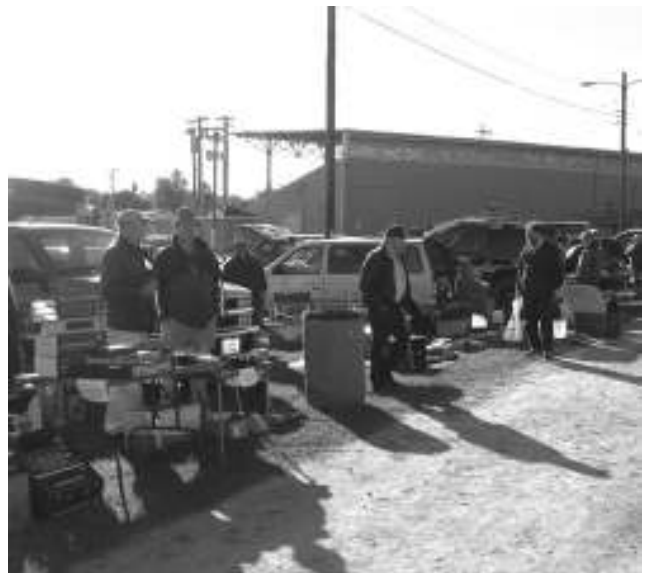
It looked like "Radio Row" as the early morning sun rose up in the East.

Actually, "word of mouth" was mentioned by 40% of the respondents so it important to make good impressions and "talk it up" when the opportunity presents itself