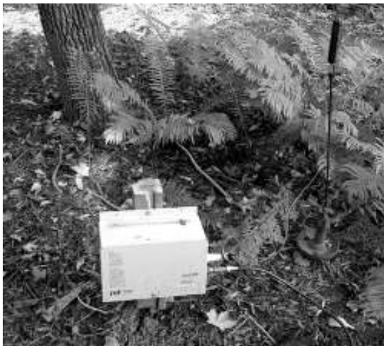
Metal Termination Box for Inverted L

First I connected my couple of radials and the metal termination box to the ground rod and connected the feed end of the antenna to the termination box feed through insulator.