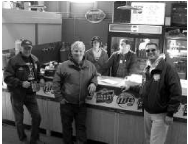
The refreshment concession gang took a break from kibitzing to pose for posterity.

Some of the advantages of the Fireman's Park location were the space available, barn for use in the event of rain and/or for commercial vendors, bathrooms and use of the concession booth for coffee, soda, donuts etc. sales.