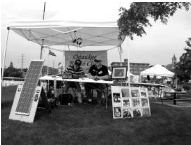
Paul (KD9FM) and Tom (AA9XK) set up the station with solar-battery power and ORC recruitment materials for participation in the National LightHouse Activation contest.

“Congratulations to W9CQO on achieving third place in the ARLHS annual NLLW contest.”