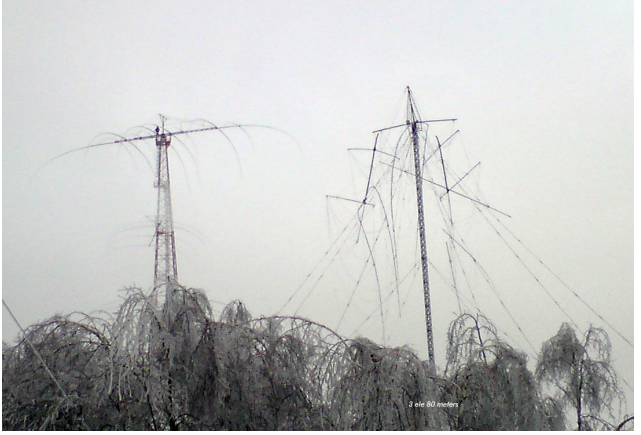
RD3A beam antenna following a freezing rain in Europe. Note that the ice overloaded and broke the trees as well as the beam elements.

The following photo of the RD3A antenna farm is relevant only due to the weather we share and as an example of what we all might experience in the event of a freezing rain.