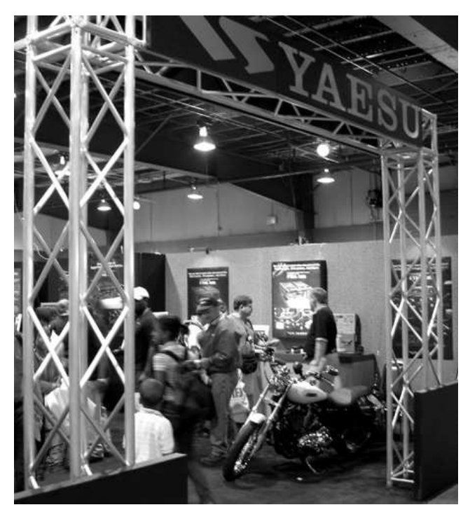
Yaesu introduced a new rig fit for motorcycle use. I prefer to listen to the "potato-potato" sound.