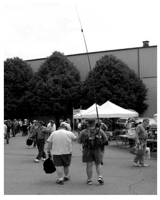
Some HT's are bigger than others. Some fit in your pocket and some on your back. The HF pedestrian mobiles were many and were an interesting, very strong group.