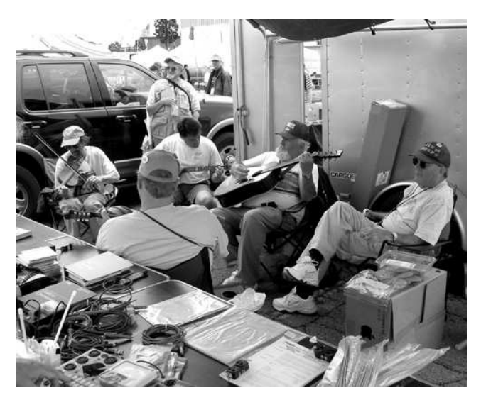
The KY bluegrass group was at Dayton again providing entertainment and an occasional good deal.