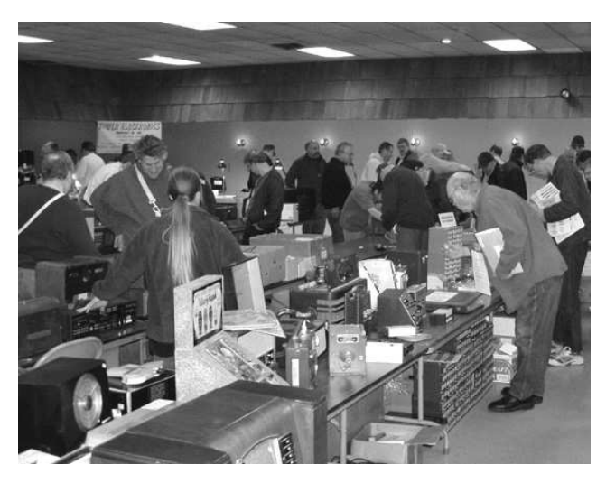
The browsing was fun and yes, there were some good deals.