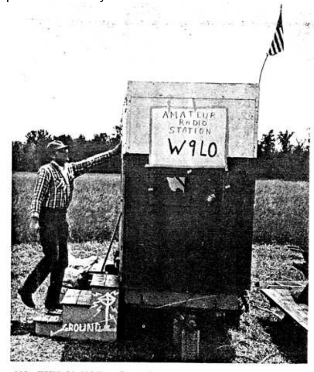
NO, THIS IS NOT A PRIVY. Bob Krubsack WA9KBB and the operating position he worked is mounted on wheels. The call letters W9L0 were used to identify the Club during the contest.

first transceiver that ORC ever used on Field Day. (Although 1974 may not have been the first year.) It was a conventional tube type 150 watt transmitter, CW only, 80,40 & 20 meters, that I built somewhere about the late 1960s, complete with a self contained VFO and "spot" switch, which turned the VFO on and enabled you to zero-beat the calling station before transmitting. That's the way it was done in those days. And that's one of the reasons why scores were not as high then as they are now. Several hundred modifications later I turned it into a transceiver by tapping a feed off the local oscillator of the Drake R-4 Receiver, and feeding it into a converter with an output on the operating frequency. It worked quite well, and we used it on FD through 1981. The key clicks were magnificent—The phone stations couldn't hear a thing through them. That's why we always beat them. Another notable feature was its weight, about 1 pound per watt of power output. That is to say, about 150 pounds. I can't even lift it anymore. It didn't measure up to the Yeasu FT-1,000 that we use now, but then neither did spark measure up to CW. But they both pointed the way to where we are now.