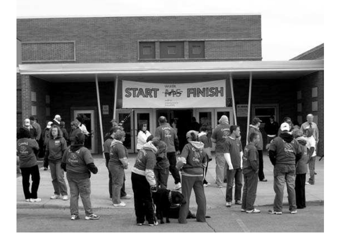
The "MS Walkers" crowd was gathering at the starting point of the Cedarburg High School.

Members of the ORC answered the request for service by providing communications between the MS Walk center at the High School, enroute walkers and the three refreshment sites. While some rain was predicted it turned out to be a really nice day for some exercise and to help out.