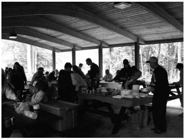
The meat was tender, corn was sweet and food and camaraderie were great. Even though there was the threat of rain it turned out to be a great day.