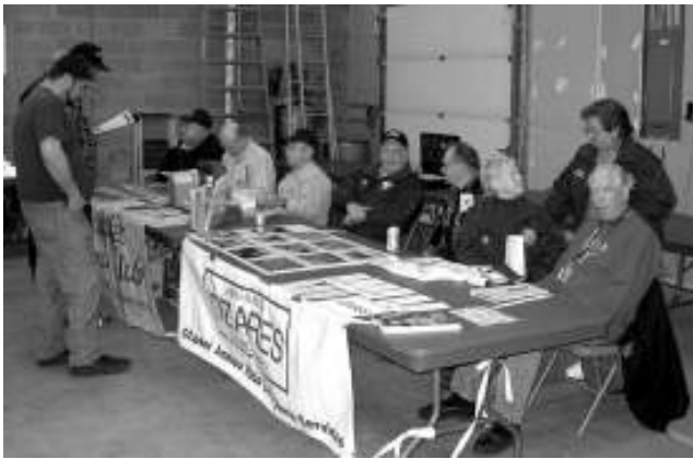
ORC members were manning both the ORC and OZARES tables.