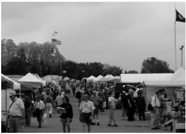
When the rain subsided the crowds returned to the flea market in force with a determination to make up for lost time.