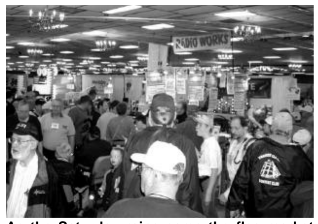
As the Saturday rains came the flea market thinned out and the halls filled with damp bargain hunters. However, it was during the rains that the greatest treasures were discovered in the flea market by W9IPR.