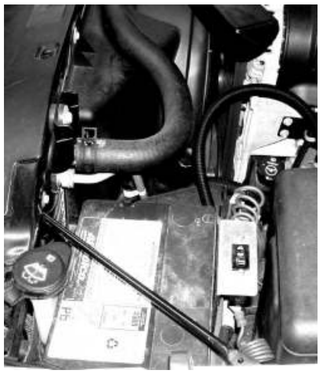
Here the circuit breaker assembly is installed with the positive lead connected to the battery positive terminal. A GM dealer or parts house can provide "long" battery bolts to accommodate the addition of the lugs. Note the battery accessory power box in the upper right of the photo.

The circuit breaker provides protection of the wiring from the battery to the transceiver (in addition to the transceiver fuses) and also allows me to switch the power off to the radio if desired. The circuit breaker is mounted on a bracket that can slide down between the battery and battery blanket. The wires are coiled only to allow for extra wire when removing the bracket. The circuit breaker attached to the battery positive terminal and the negative power lead attached to the battery negative terminal.