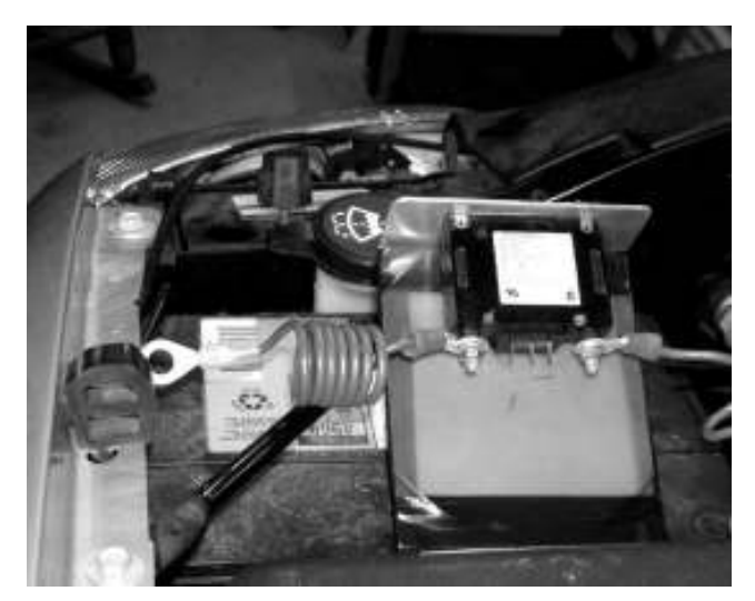
Here is shown the unconnected circuit breaker mounted in the aluminum bracket. The bracket was insulated with thick electrical tape in the area that inserts down along the side of the battery.

The next issue was how to get power to the transceiver, which I had decided to mount under the rear seat. There is a battery power accessory terminal in a red case under the hood but I elected to go directly to the battery using a circuit breaker system I had used on the previous vehicle.