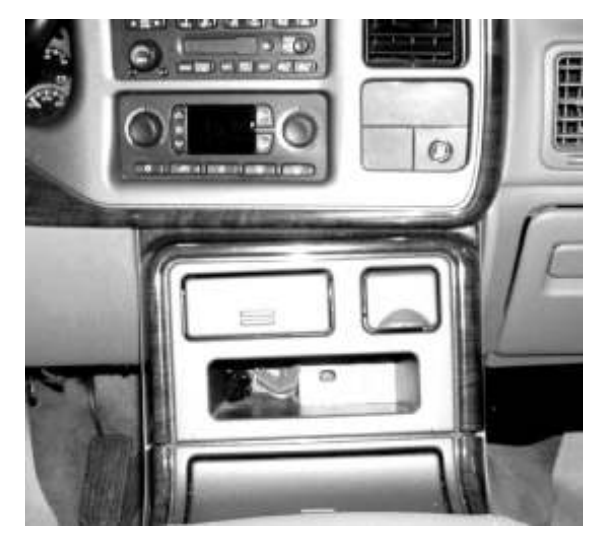
While the DVD compartment was also too small for the control head it did allow for rear access of the control head cable and fabrication of an "insert mount" for the control head.