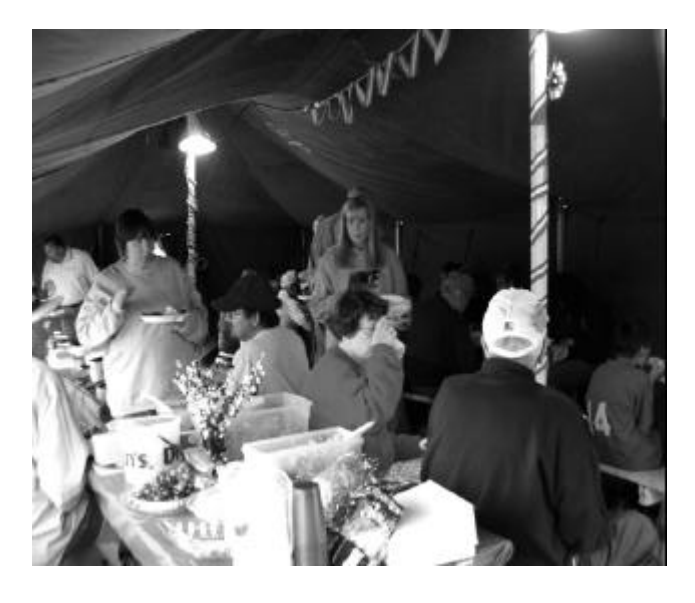
As the sun went down the eating and drinking continued until the tables were required for the sheepshead card games.