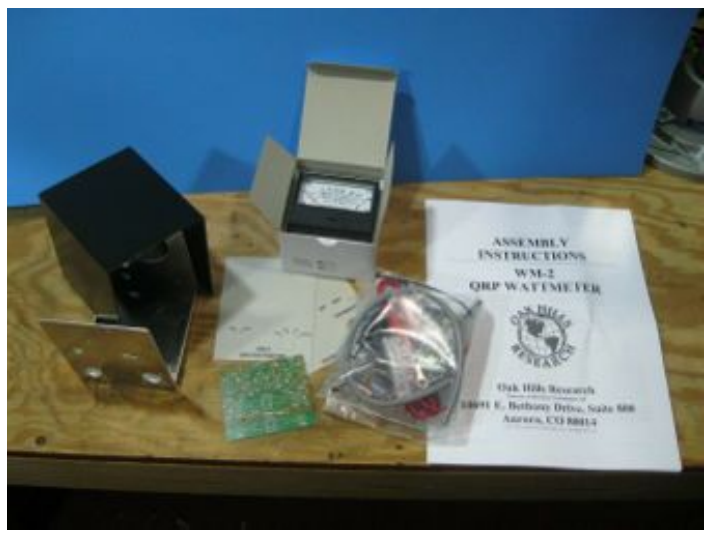
the interconnect parts and of course the meter.

The kit was shipped lightning fast and I had it within the week that I ordered it. It includes everything you need for a successful build including a very nicely done case with labels for all the controls and connectors. It's a pretty straightforward build with a small circuit board with 24 components and two toroids that are wound to sense RF and then all of