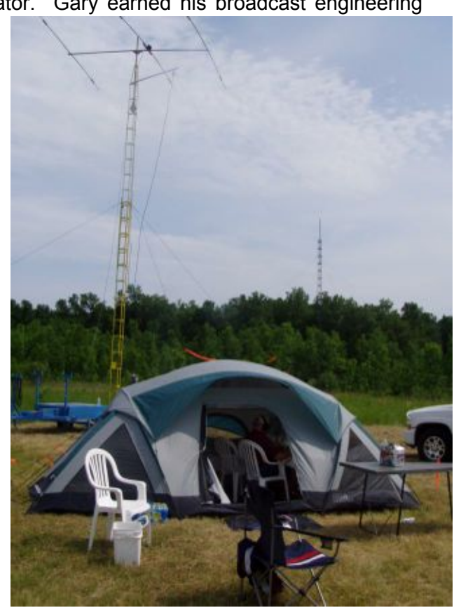
Gary, we will miss you at our Saturday morning breakfast, on 3860 and at field day.