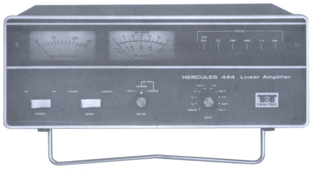
Ten-Tec Model 444 Hercules Linear Amplifier

All the Omni, Omni Series B, and Omni Series C radios had a full complement of accessories to go along with them. Ten-Tec was an early player with a solid-state linear amplifier with the Ten-Tec Model 444 Hercules: