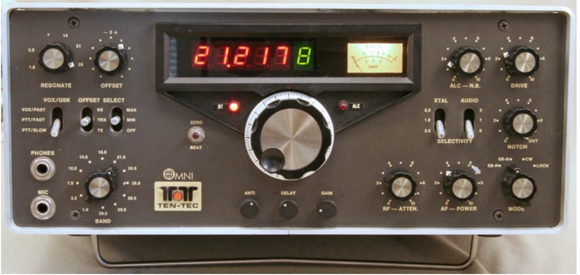
Ten-Tec Omni C HF Transceiver – Model 546C