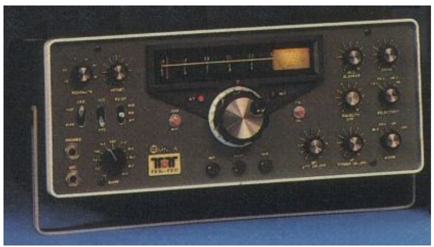
Ten-Tec Omni A HF Transceiver – Model 545

running Omni series – the Omni A 160-10-meter solid state HF Transceiver. These were competitive radios – but perhaps lacked in the physical charm exuded by the more "stereo equipment" looks of the popular Kenwood and Yaesu hybrid Transceivers. These included the Kenwood TS-820S and the Yaesu FT-101E. Here is the model 545 Omni A – as introduced in 1978: