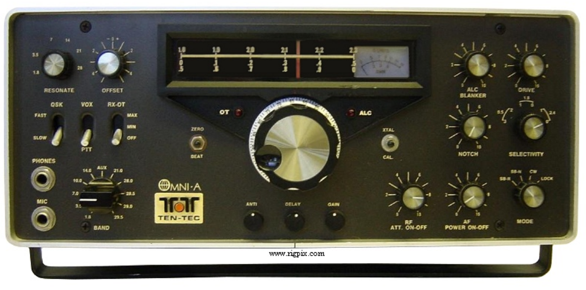
Ten-Tec Omni A HF Transceiver – Model 545B

Here is a picture of the Omni A, Series B, showing a clear view of the analog readout. As explained above on the original Omni A, see the calibrator (CAL) button at the right of the main tuning knob.