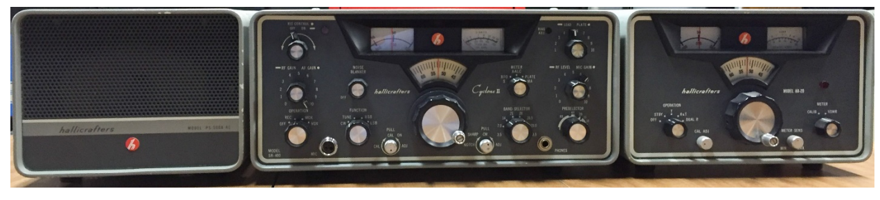
Left to Right PS-500A-AC AC Power Supply, SR-400 Cyclone II Transceiver, HA-20 DX Adapter

Let's look at accessories – all accessories work with all models: