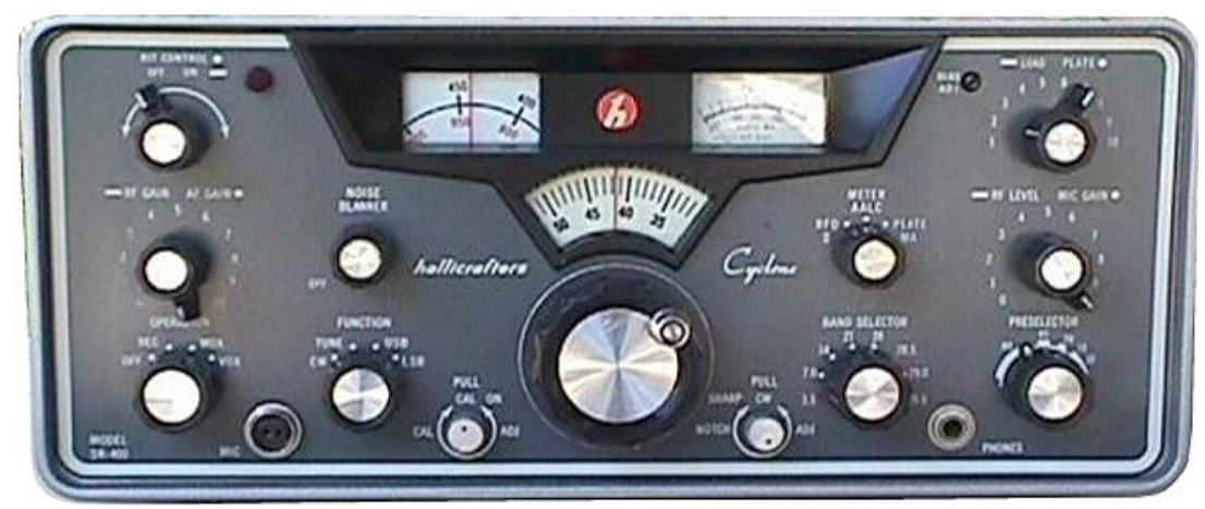
Hallicrafters SR-400 Cyclone 80-10 Meter Transceiver

I would wager, however, that you will not guess the radio's identity (before seeing the picture, below) because it has been a long time since these radios graced the operating positions of competitive operators. In 1965, Hallicrafters began building a series of Transceivers with traditional model numbers but also included names based on storms. Below you see the start of that series with the Hallicrafters SR-400 Cyclone Transceiver: